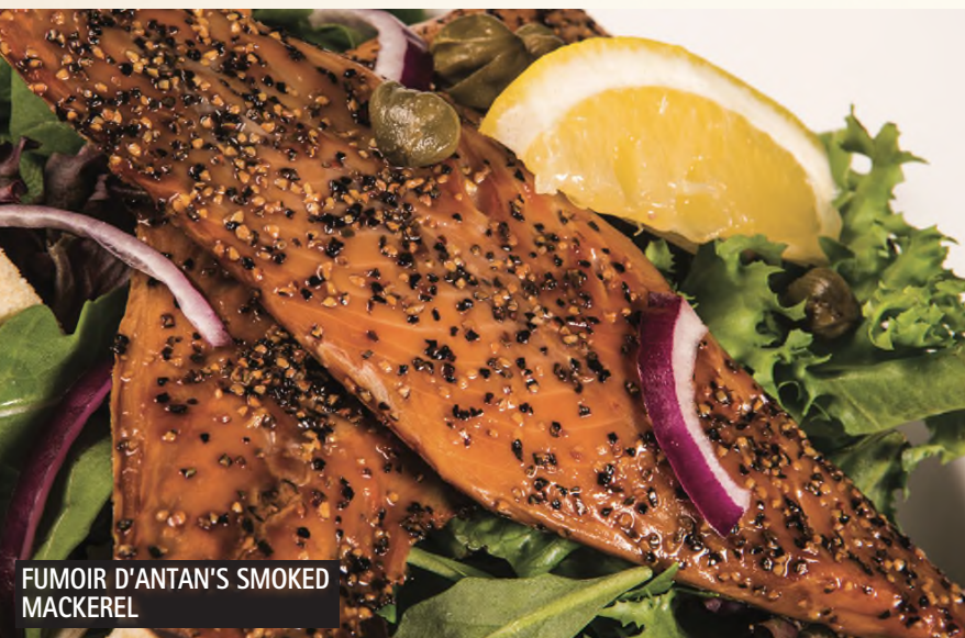
FUMOIR D'ANTAN'S SMOKED MACKEREL