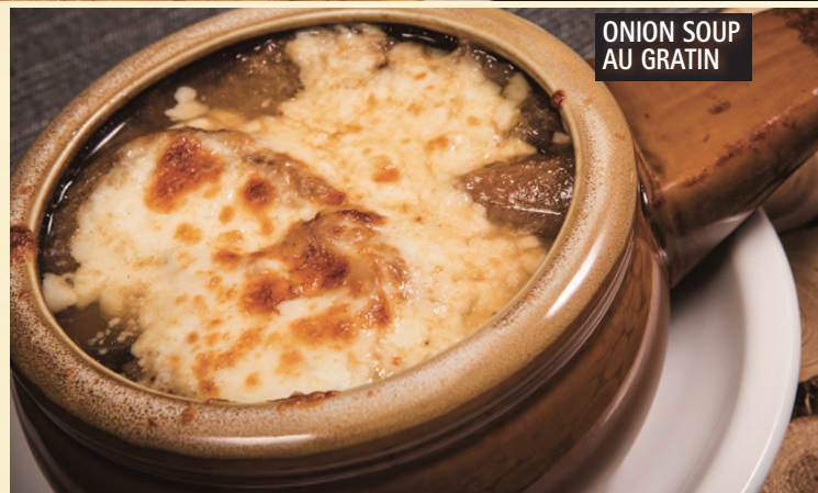
ONION SOUP AU GRATIN