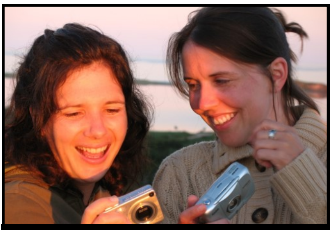
SECRETS OF SEPTEMBER SEPTEMBER 2017

A complete day of fishing. For the adventurous. $50 + tx.