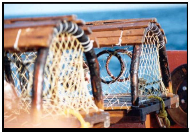
LOBSTER AND COMPANY JUNE 2017

A gourmet package! Honored each evening: lobster and seafood. On the program each day: discover the Islands during the lobster season.