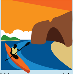
Water trail Îles de la Madeleine